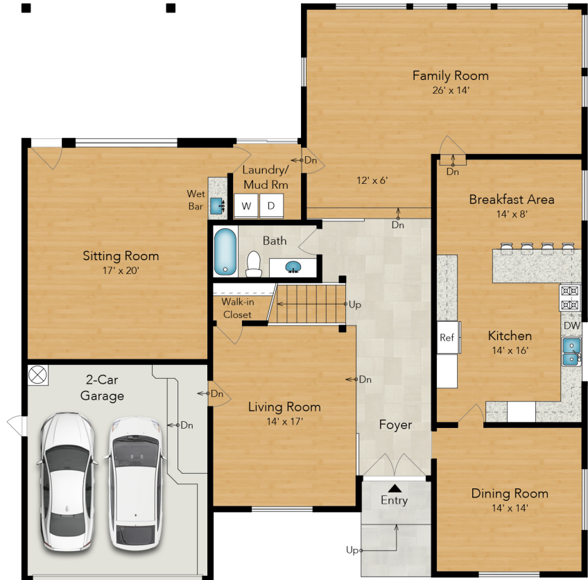
MAIN LEVEL 2,020 SQ FT