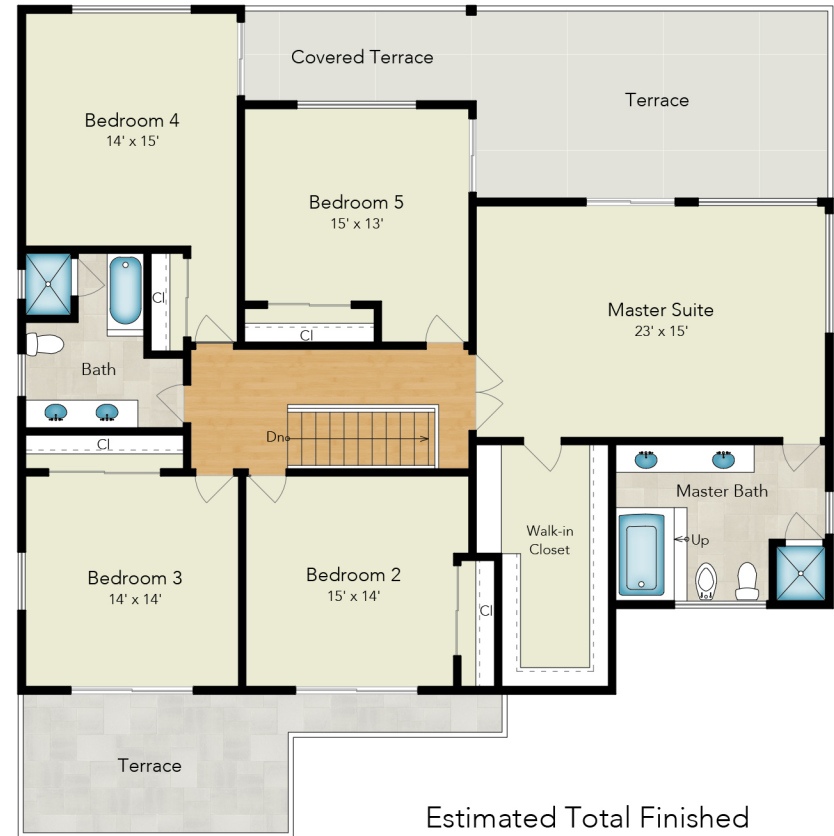
UPPER LEVEL 1,910 SQ FT

Estimated Total Finished Square Footage: 3,930 SQ FT